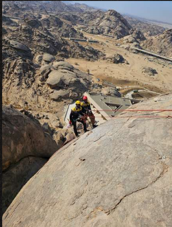
REMOTE ACCESS AND INSTALLATIONS