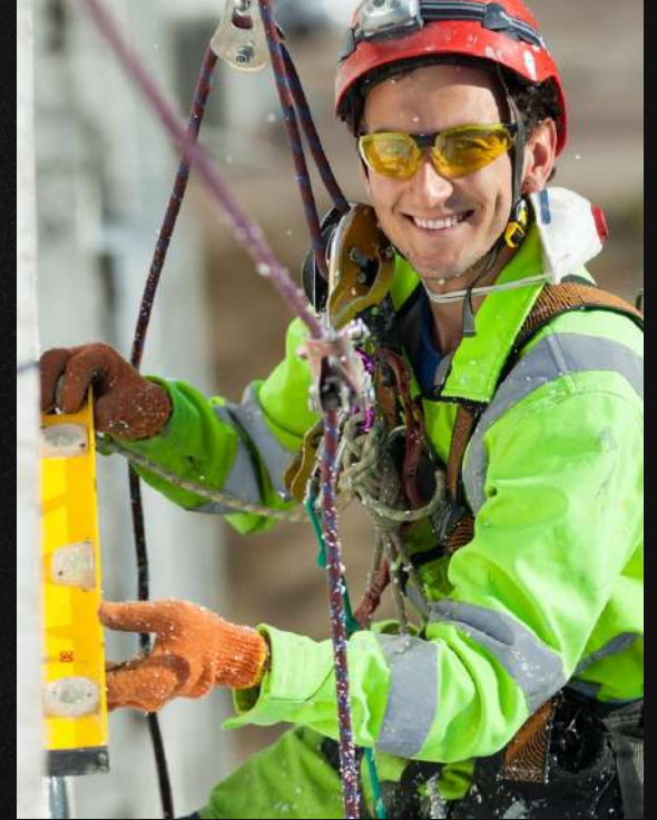
INSPECTION & CONDITION ASSESSMENT