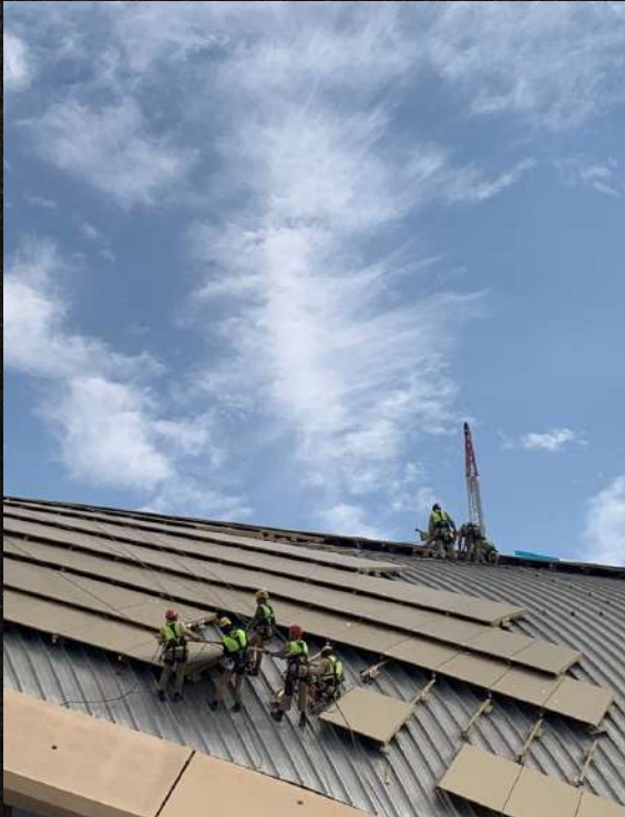
ROOFING INSTALLATION & WATERPROOFING