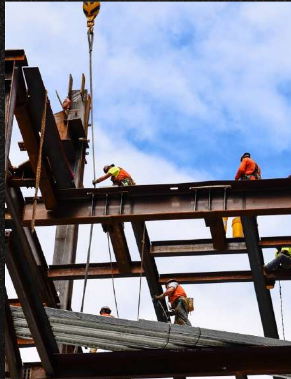
STRUCTURAL ASSEMBLY & STEELWORK